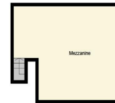
Garage First Floor

This floor plan is for illustrative purposes only. It is not drawn to scale. Any measurements, floor areas (including any total floor area), openings and orientation are approximate. No details are guaranteed, they cannot be relied upon for any purpose and they do not form part of any agreement. No liability is taken for any error, omission or misstatement. A party must rely upon its own inspection(s). Powered by www.focalagent.com