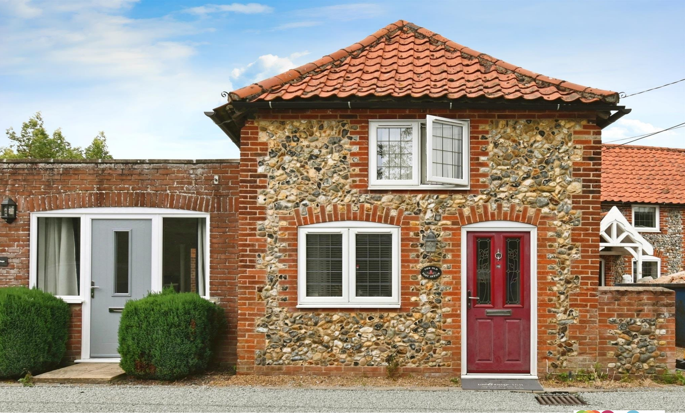
The Old Post Office Bobby Hill, Wattisfield Diss IP22 1NL