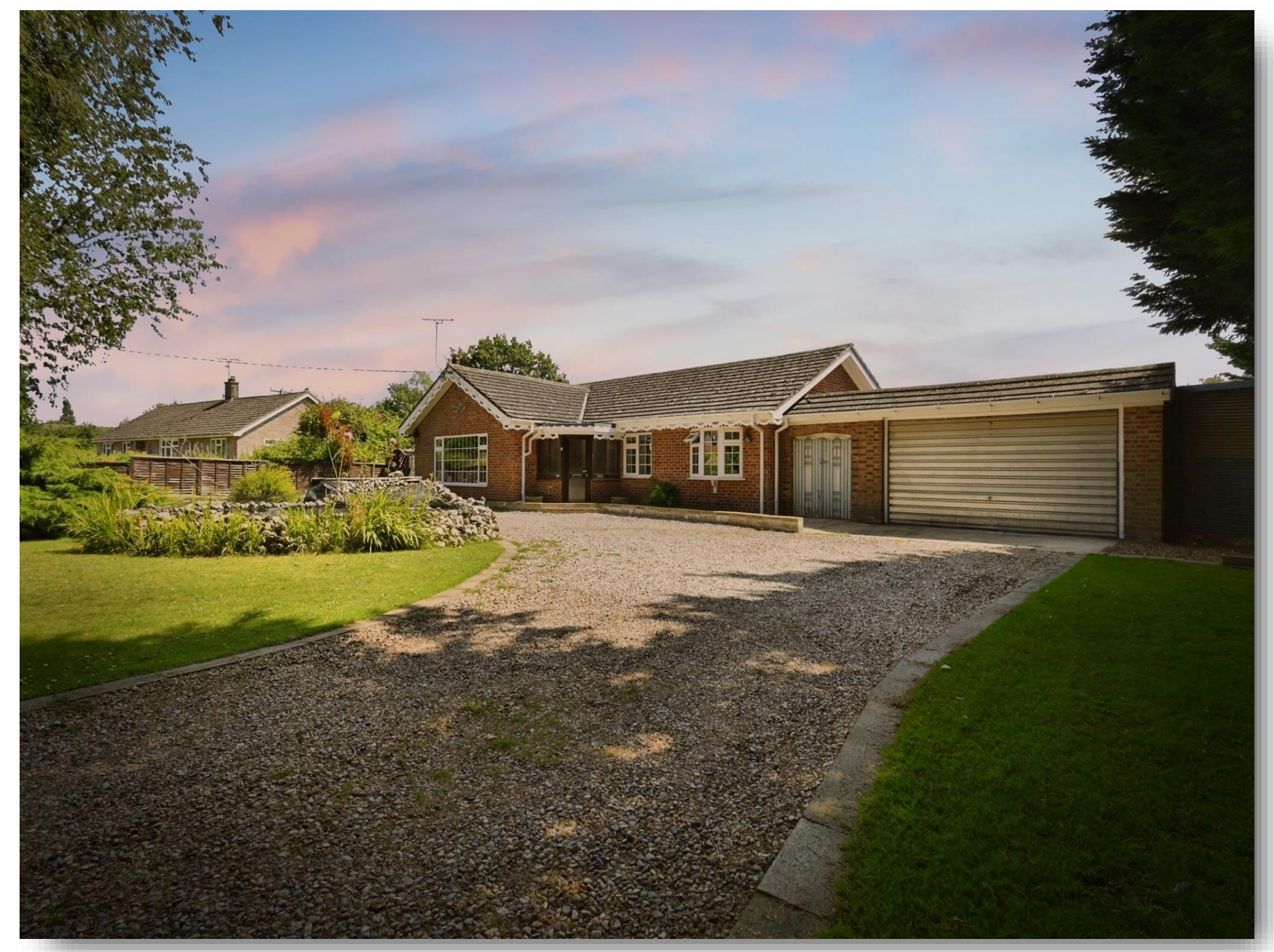
Two J's Smallworth, Garboldisham Diss IP22 2SS