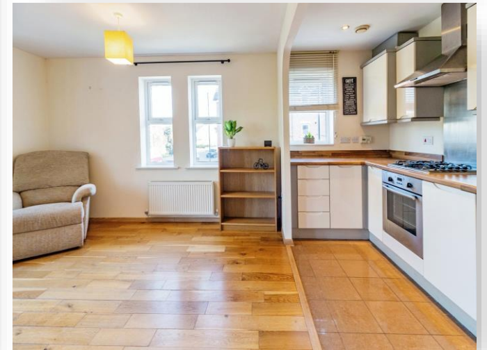
Greensand View, Woburn Sands, Milton Keynes, MK17 8GQ