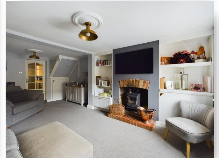
Aspley Hill, Woburn Sands, Milton Keynes, MK17 8NJ