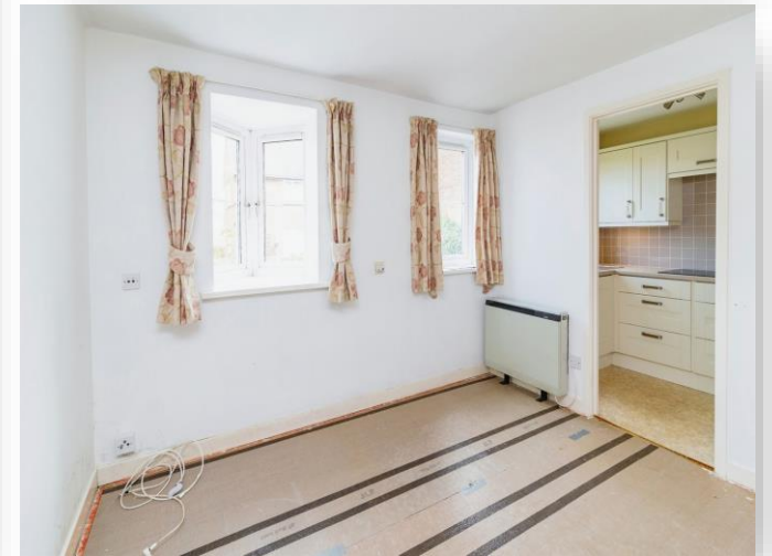
Aspley Court Woburn Road, Woburn Sands Milton Keynes MK17 8PA