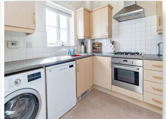
Greensand View, Woburn Sands, Milton Keynes, MK17 8GR