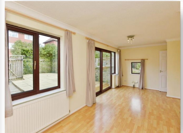
Harebell Close, Walnut Tree, Milton Keynes, MK7 7BA