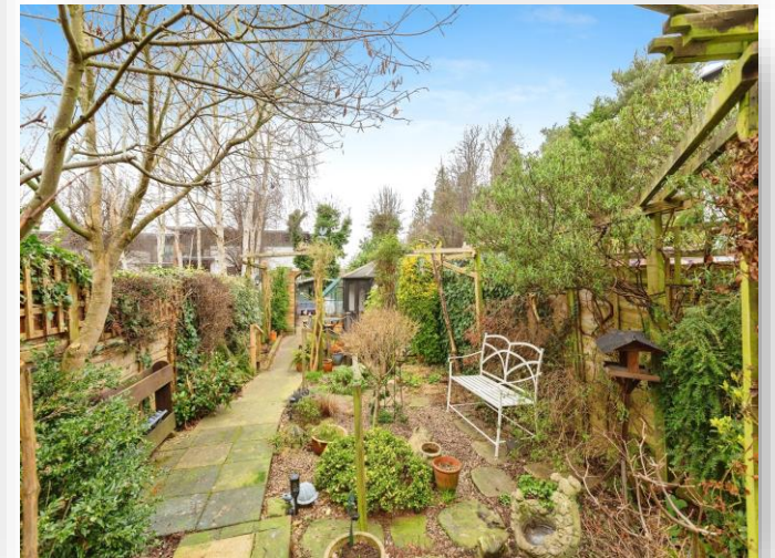
Chapel Street, Woburn Sands, Milton Keynes MK17 8PG