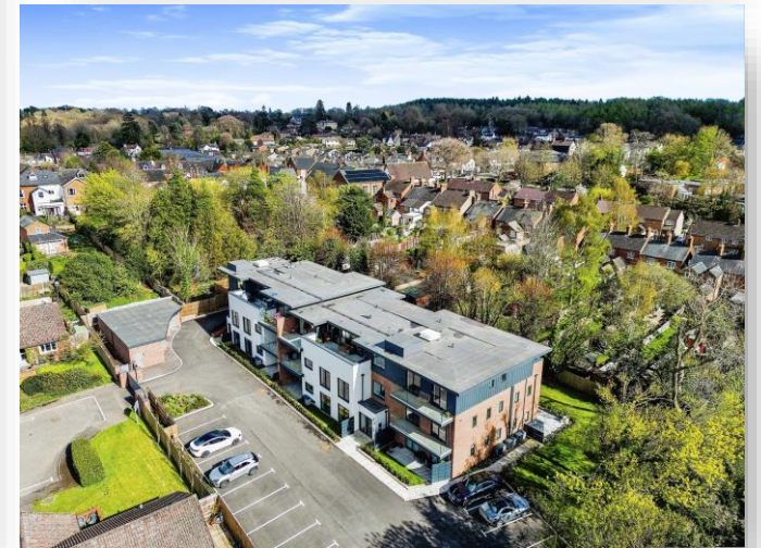
Asplands House, Asplands Close, Woburn Sands Milton Keynes MK17 8XD