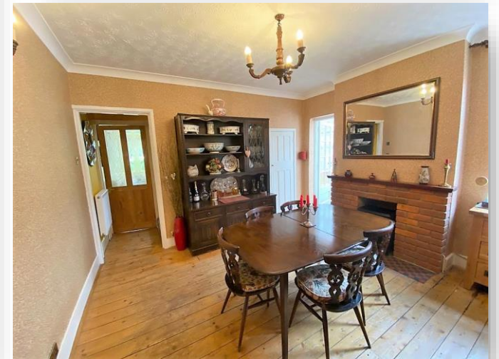
Hardwick Place, Woburn Sands Milton Keynes MK17 8QQ