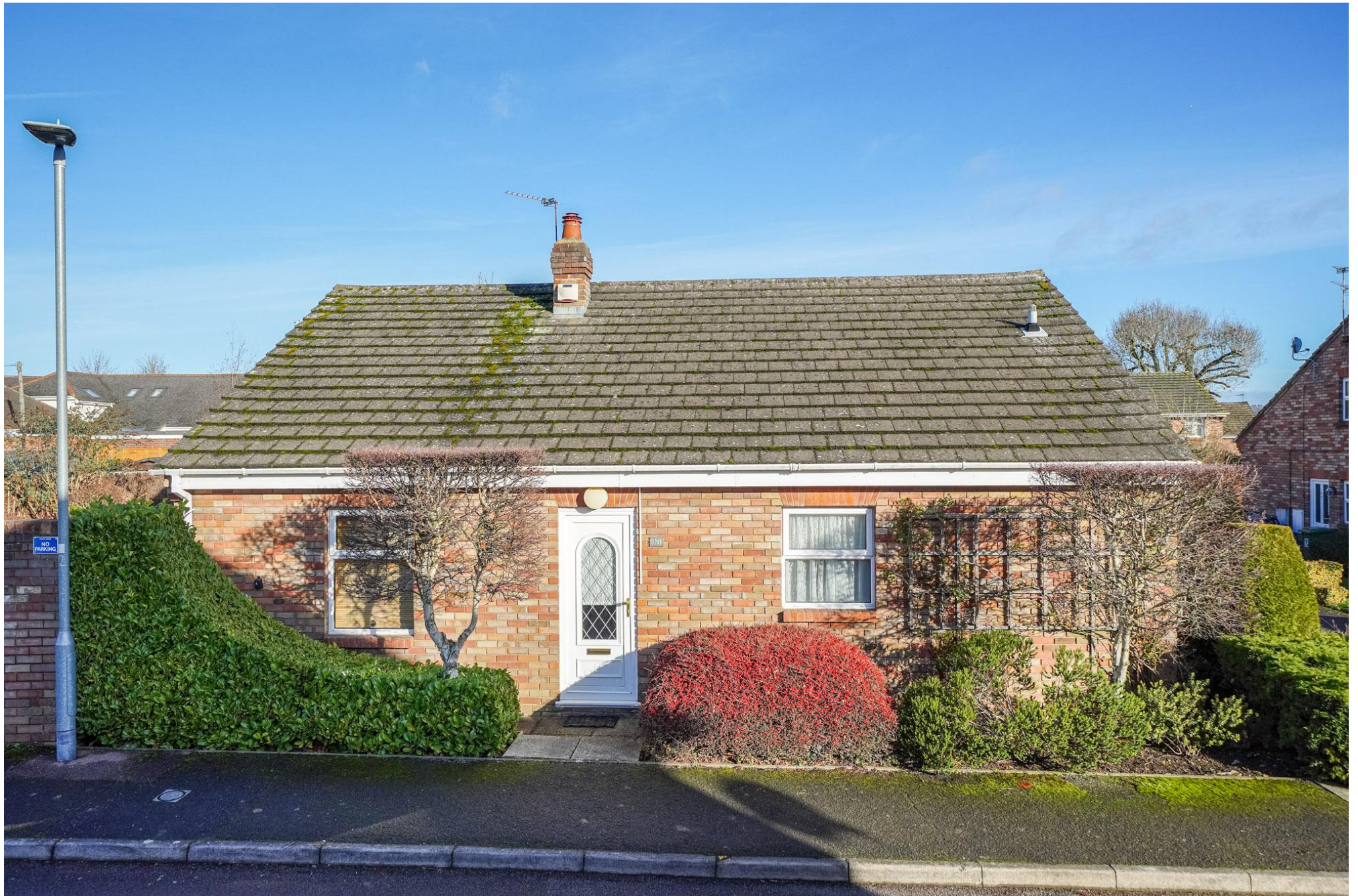
LAKESIDE, TRING HP23 5HN