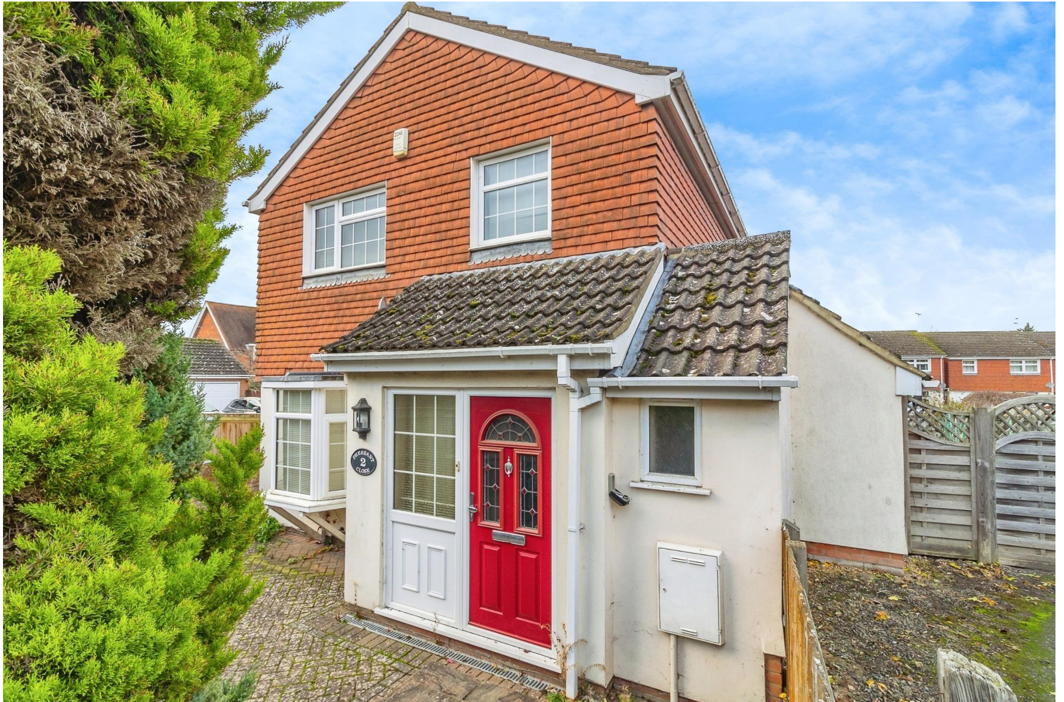
PHEASANT CLOSE, TRING, HP23 5EQ