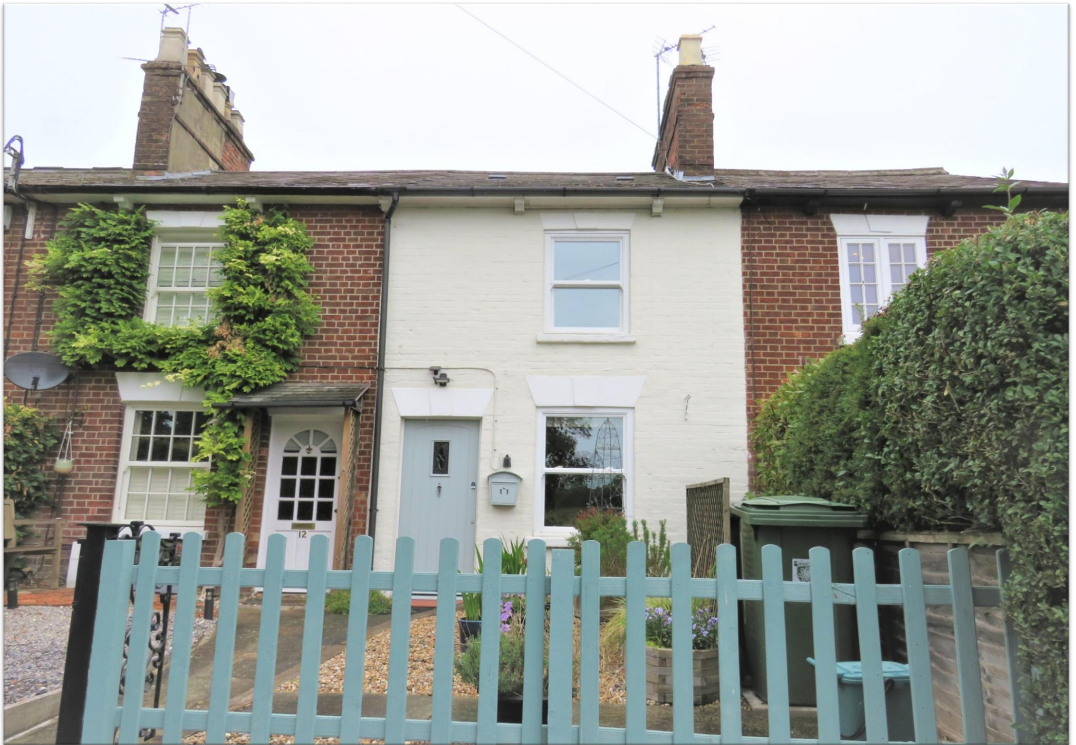
PARK ROAD TRING HP23 6BN