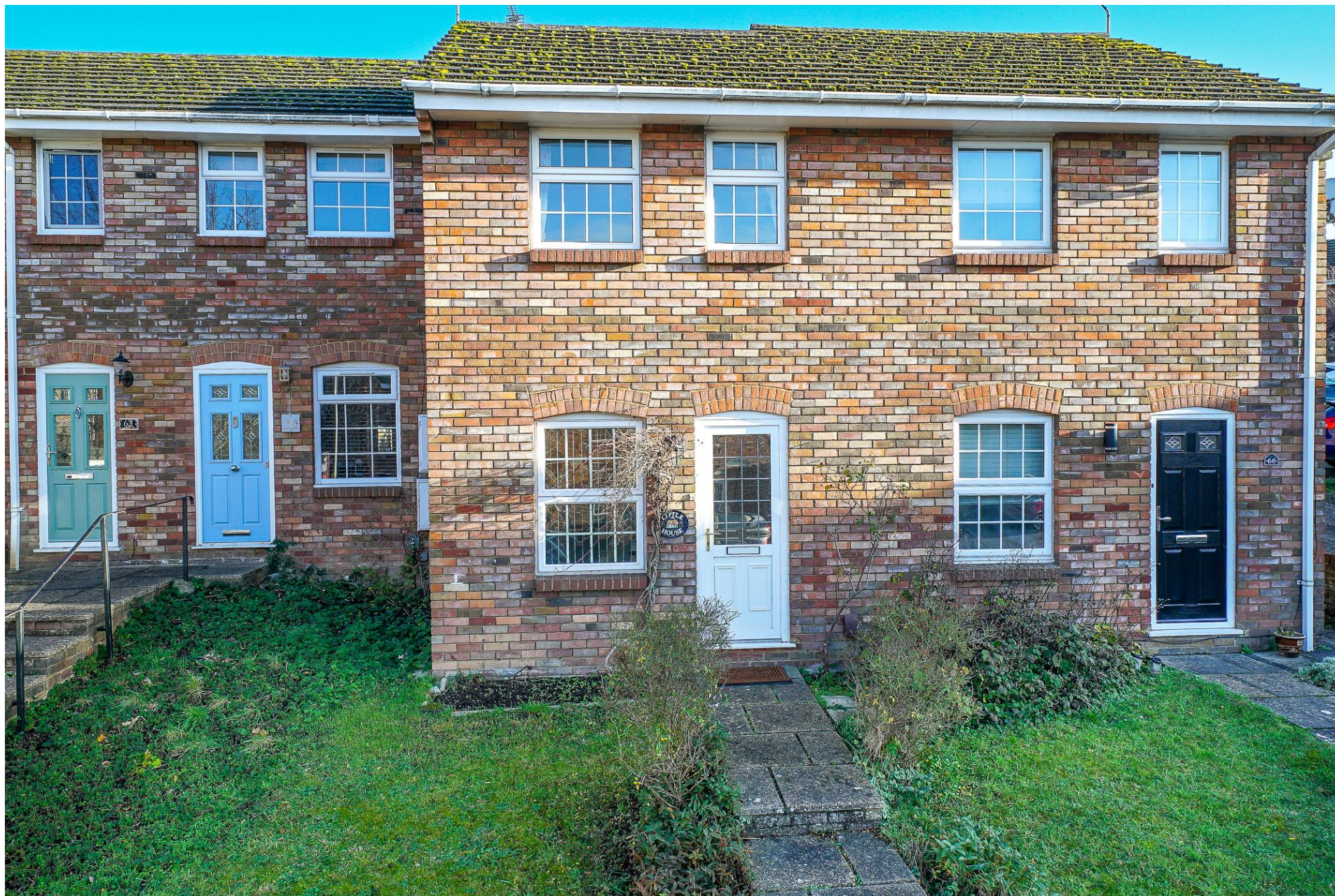
GROVE GARDENS, TRING HP23 5PY