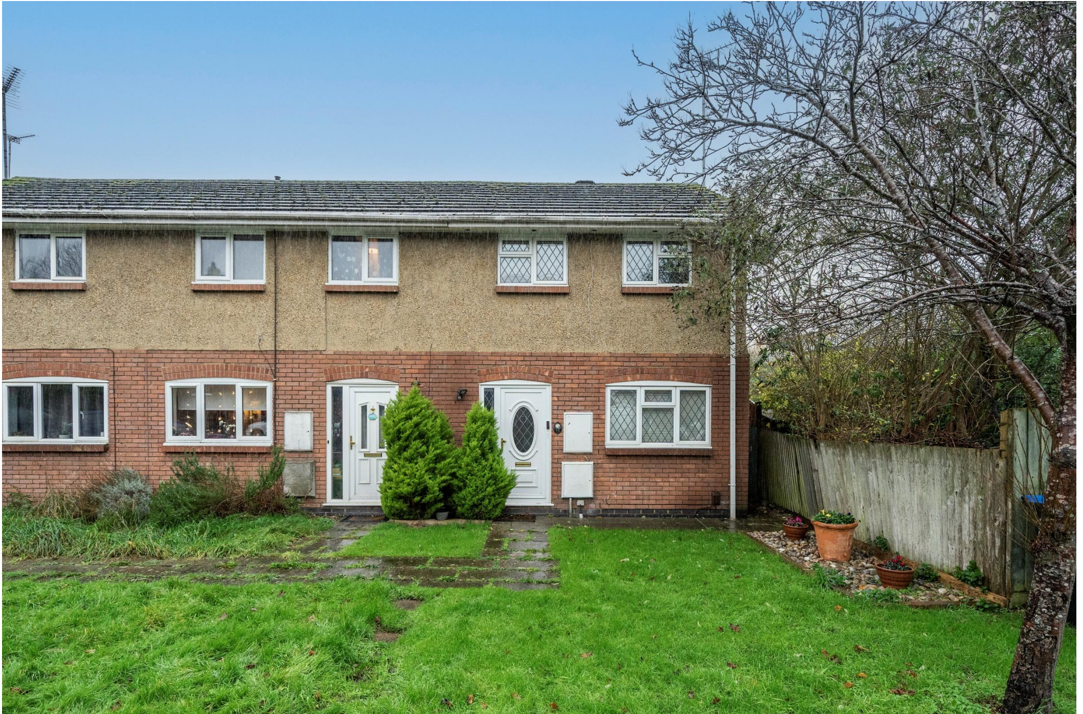
MEADOWBROOK TRING HP23 5HR