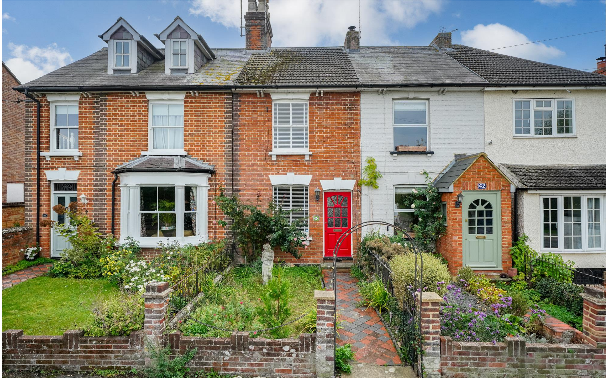
Brook Street Aston Clinton Buckinghamshire HP22 5ES