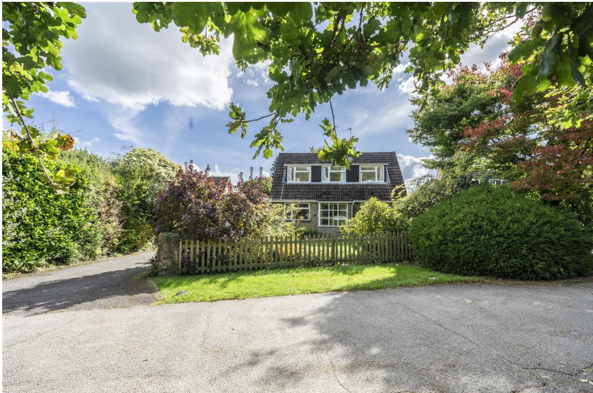
FOX CLOSE WIGGINGTON, HP23 6ED