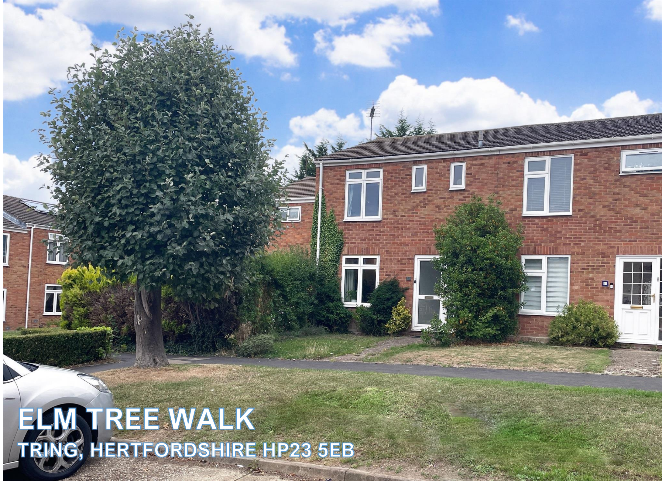
ELM TREE WALK TRING, HERTFORDSHIRE HP23 5EB