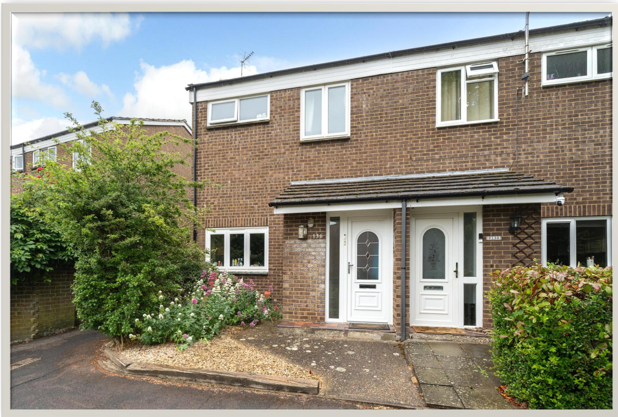
KINGSLEY WALK, TRING HP23 5DP