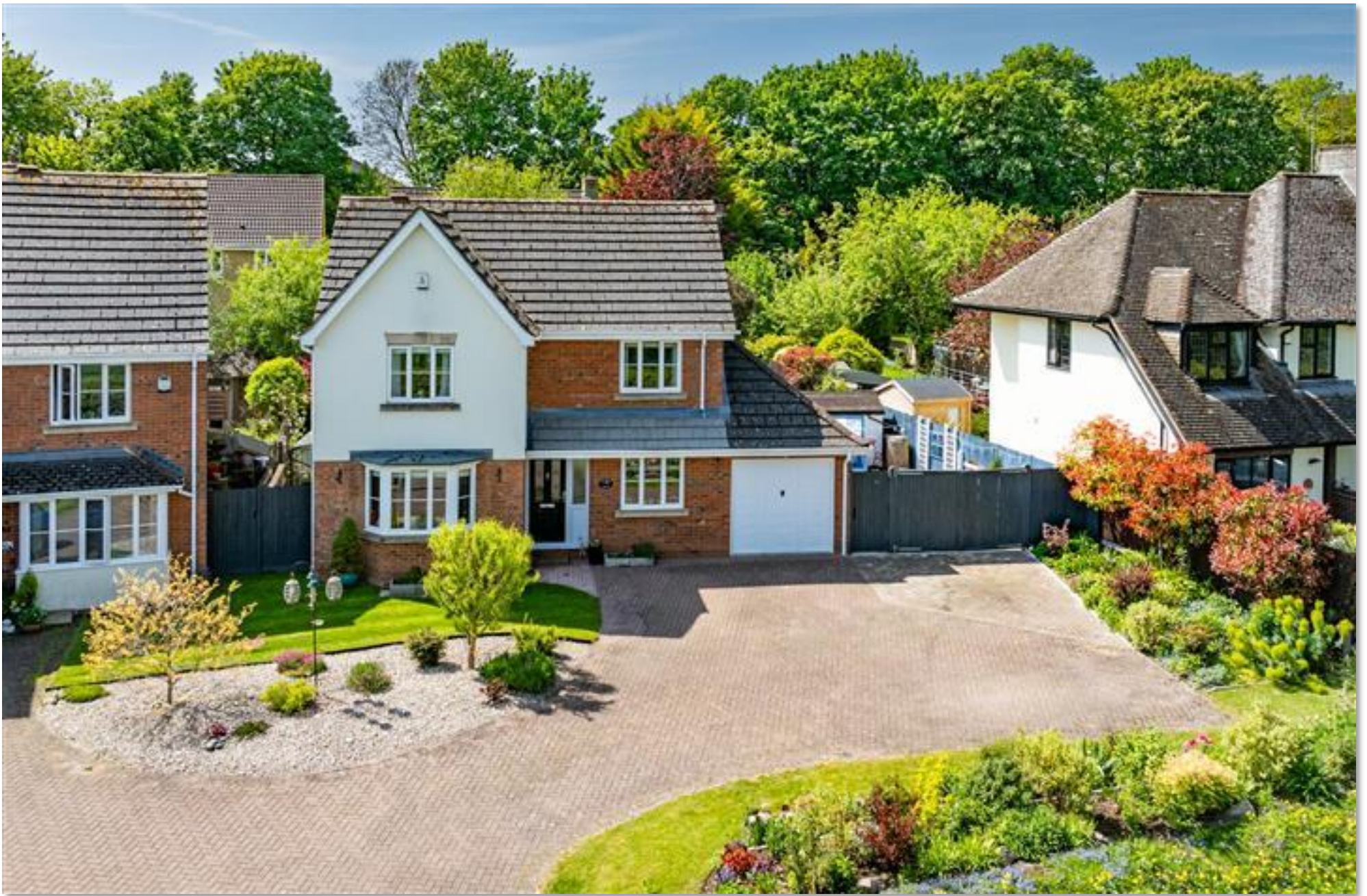
Vicarage Road, Pitstone Leighton Buzzard LU7 9EY