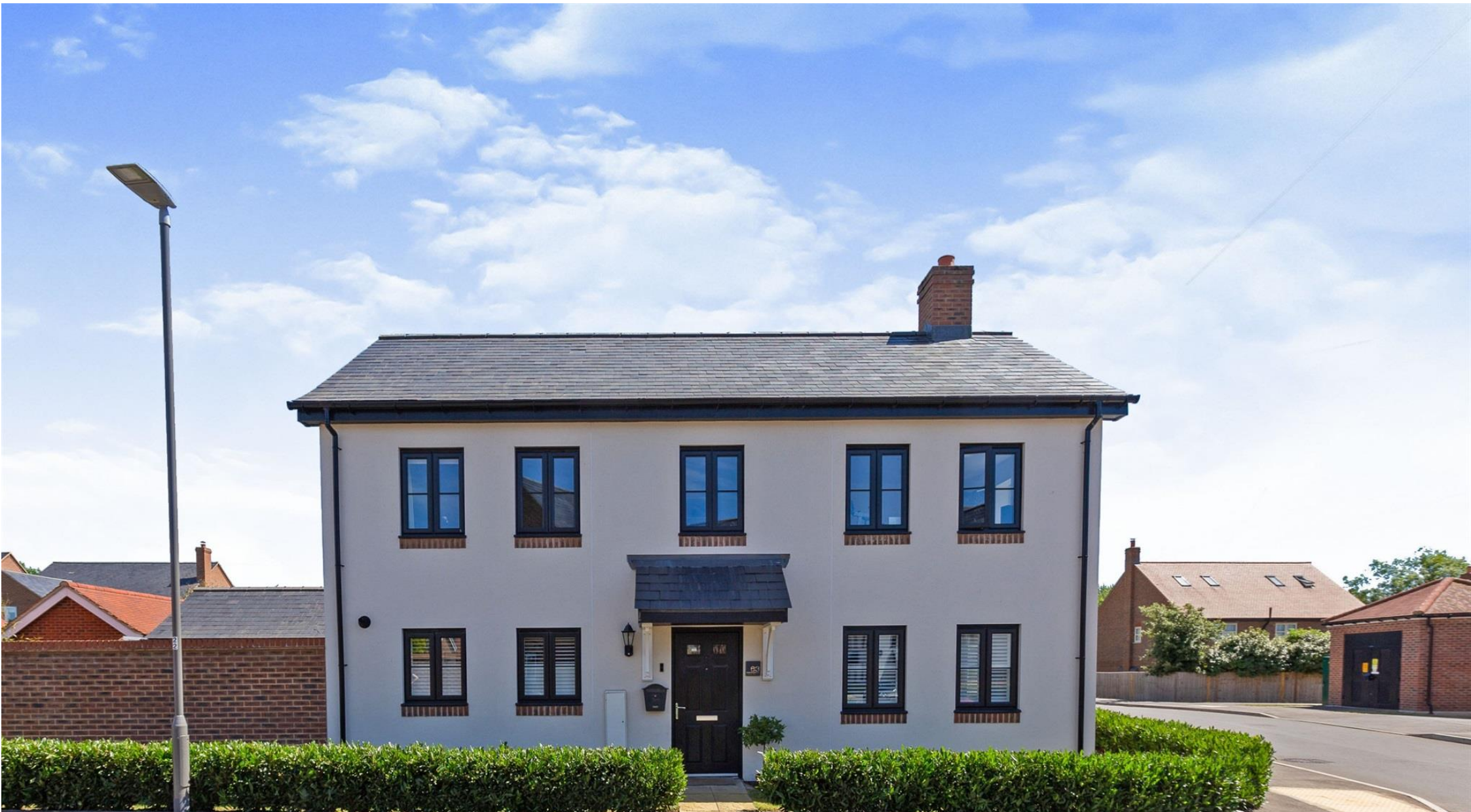
WARING CRESCENT ASTON CLINTON, BUCKS HP22 0AB