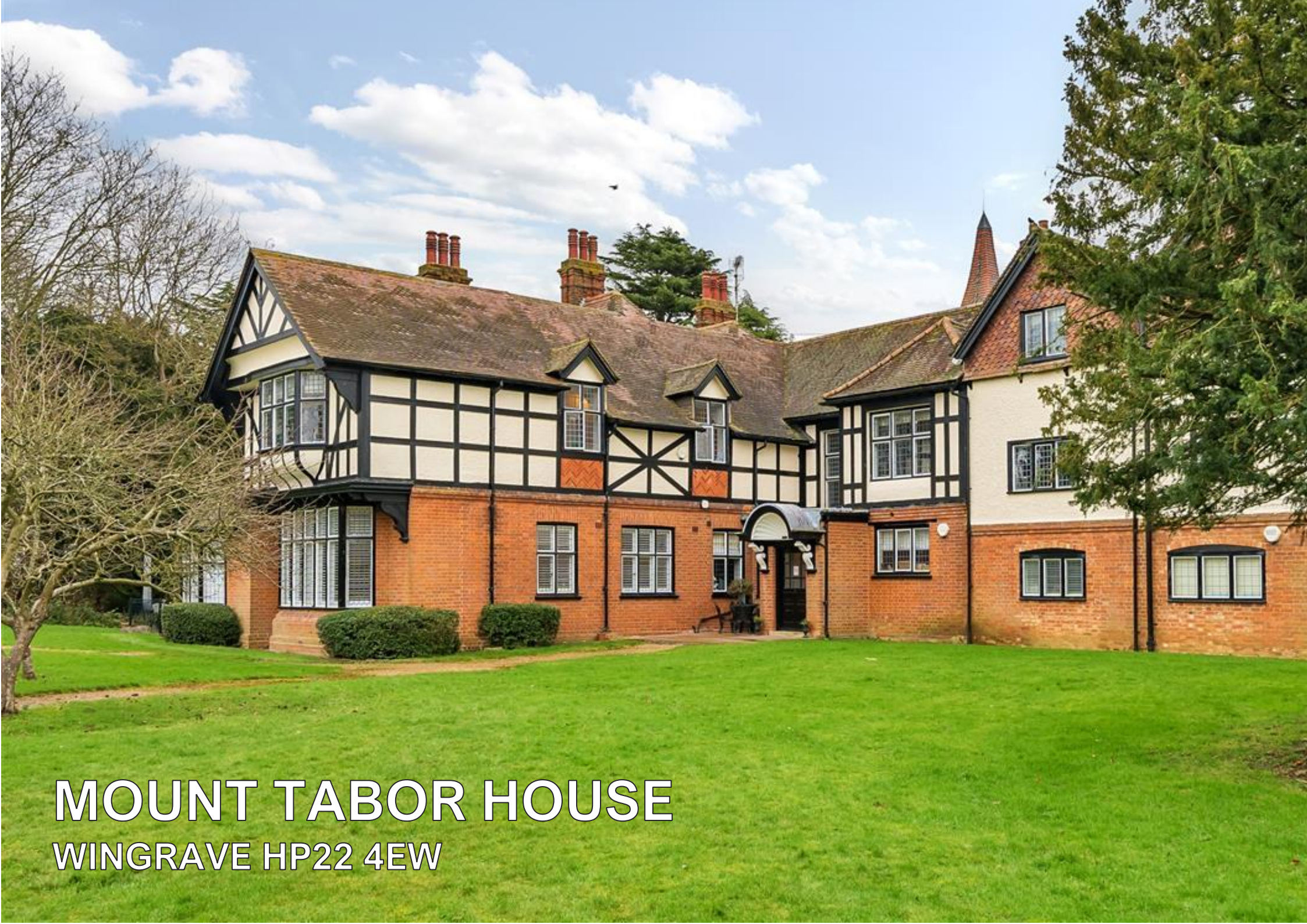
MOUNT TABOR HOUSE WINGRAVE HP22 4EW