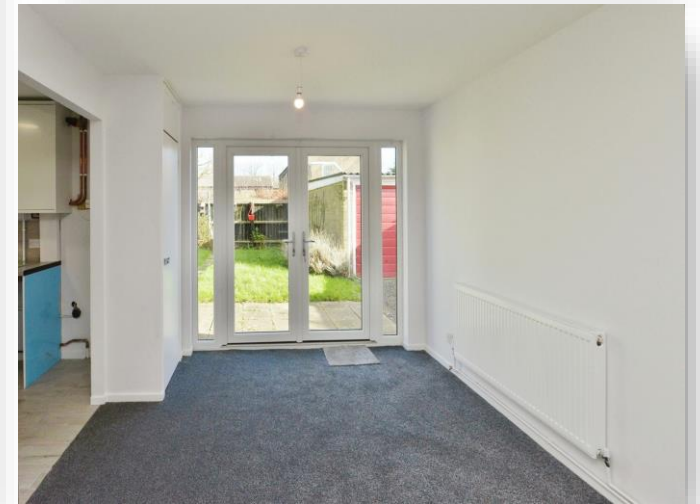
Essenden Court, Stony Stratford, Milton Keynes, MK11 1NW