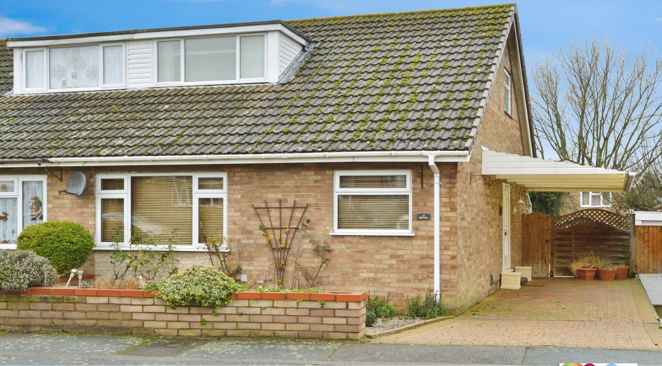
Gorricks, Stony Stratford Milton Keynes MK11 1HB