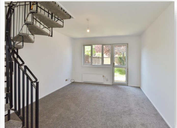
Medhurst, Two Mile Ash, Milton Keynes, MK8 8AN