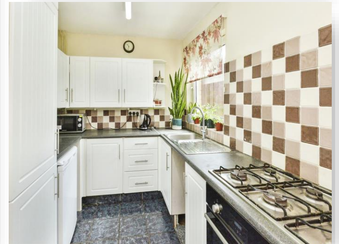
Stotfold Court, Stony Stratford, Milton Keynes, MK11 1NY