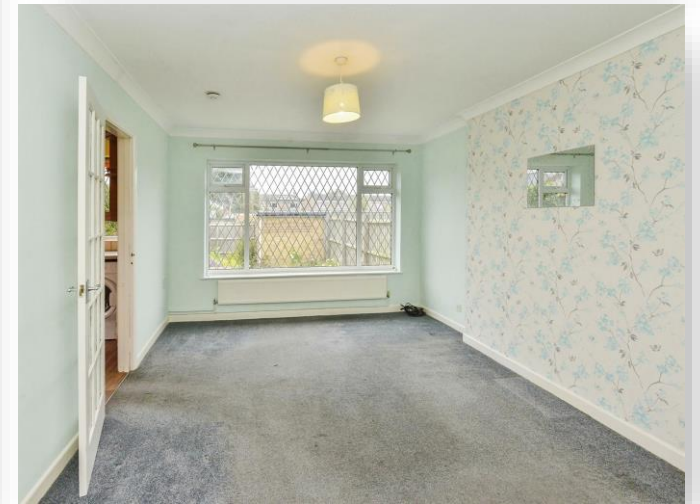
Mays Way, Potterspury, Towcester, NN12 7PP