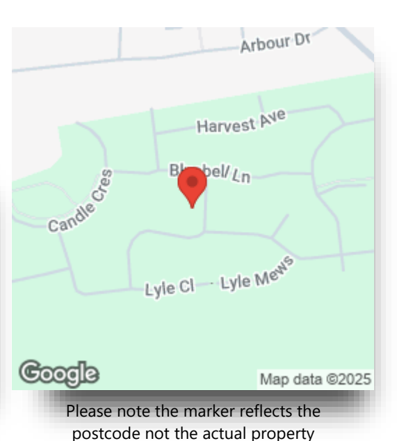
view this property online williamhbrown.co.uk/Property/DGT107474