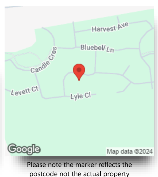
view this property online williamhbrown.co.uk/Property/DGT107210