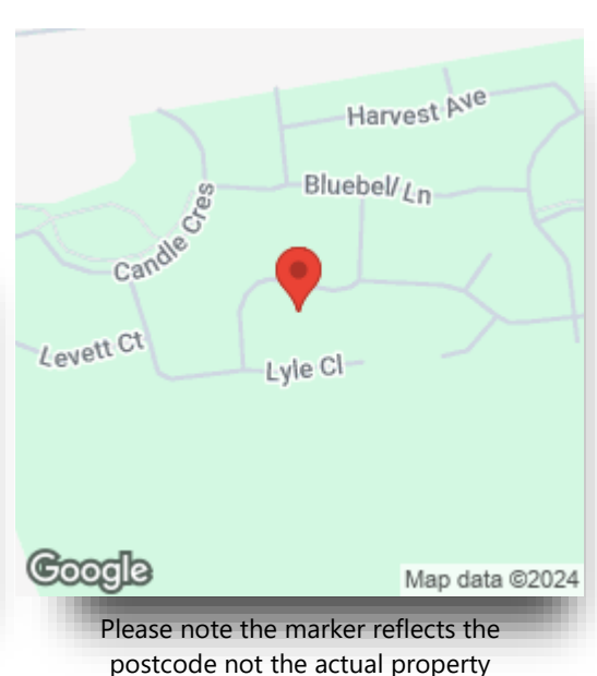
view this property online williamhbrown.co.uk/Property/DGT107210