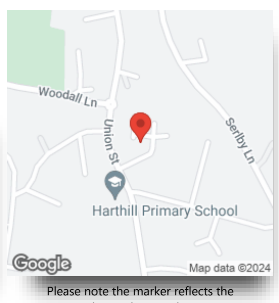
postcode not the actual property