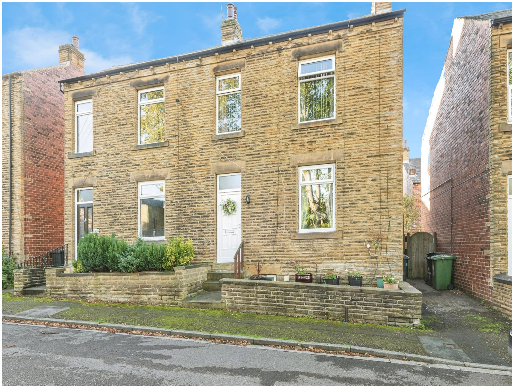
Princes Street, HECKMONDWIKE WF16 0BQ