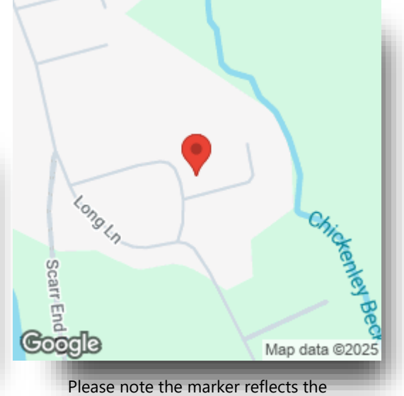
postcode not the actual property