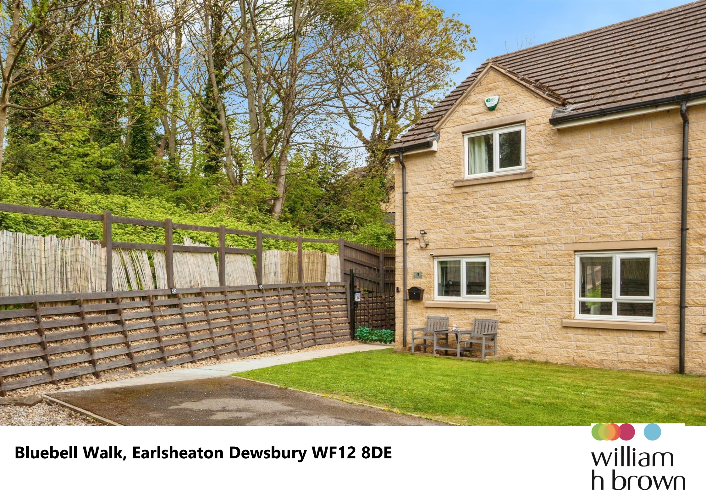
Bluebell Walk, Earlsheaton Dewsbury WF12 8DE