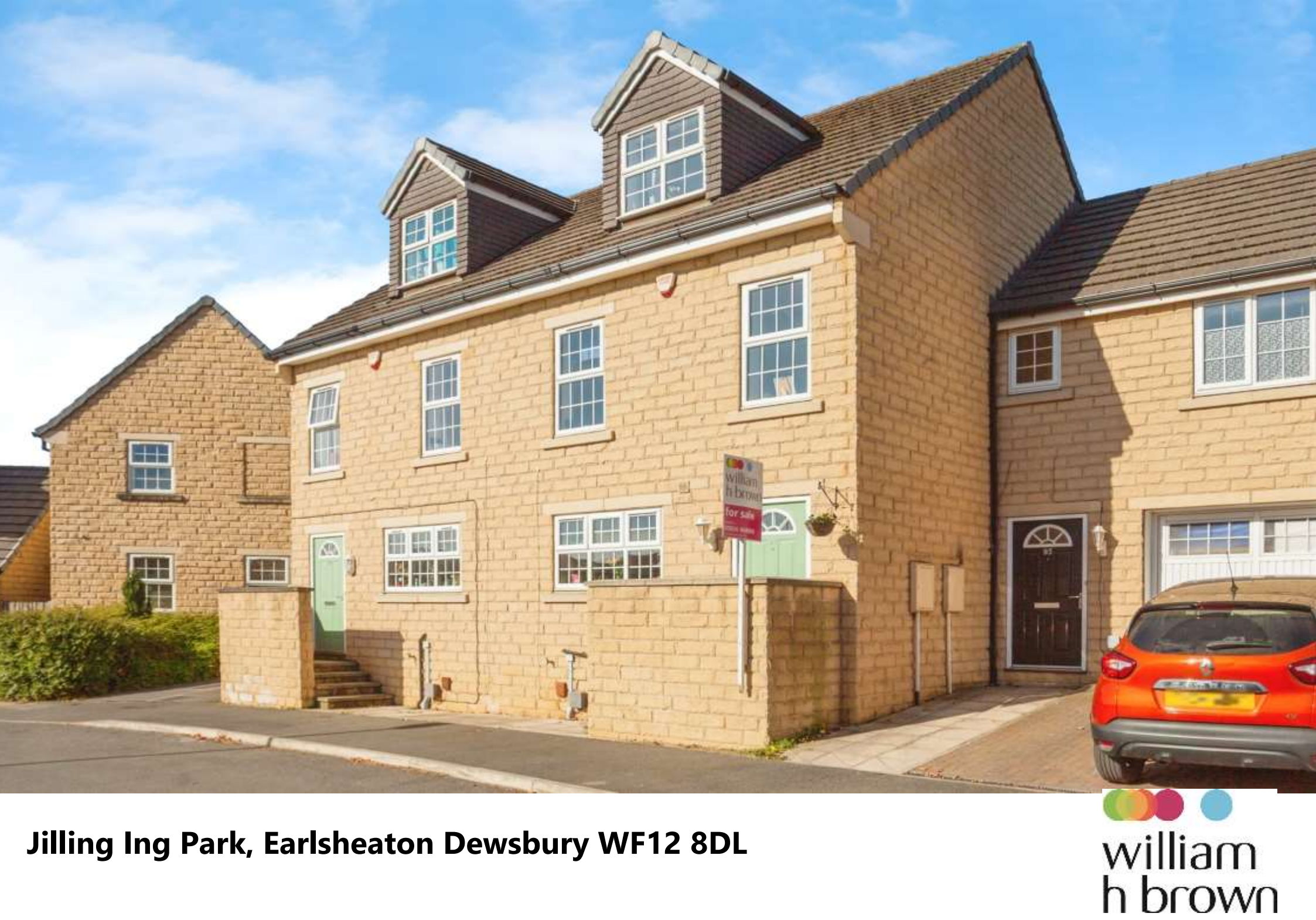
Jilling Ing Park, Earlsheaton Dewsbury WF12 8DL