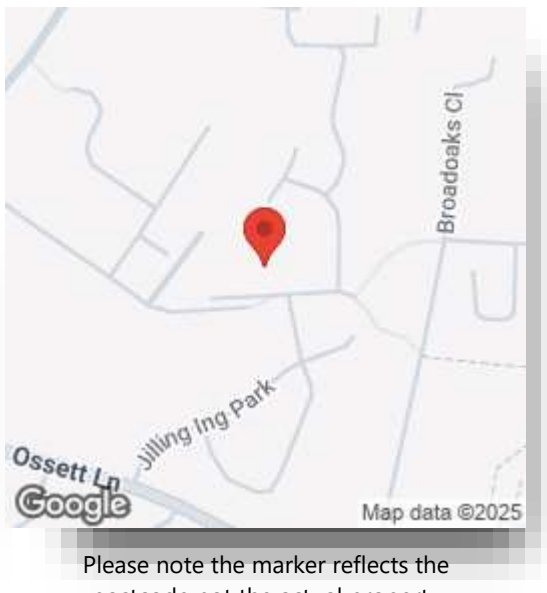
postcode not the actual property