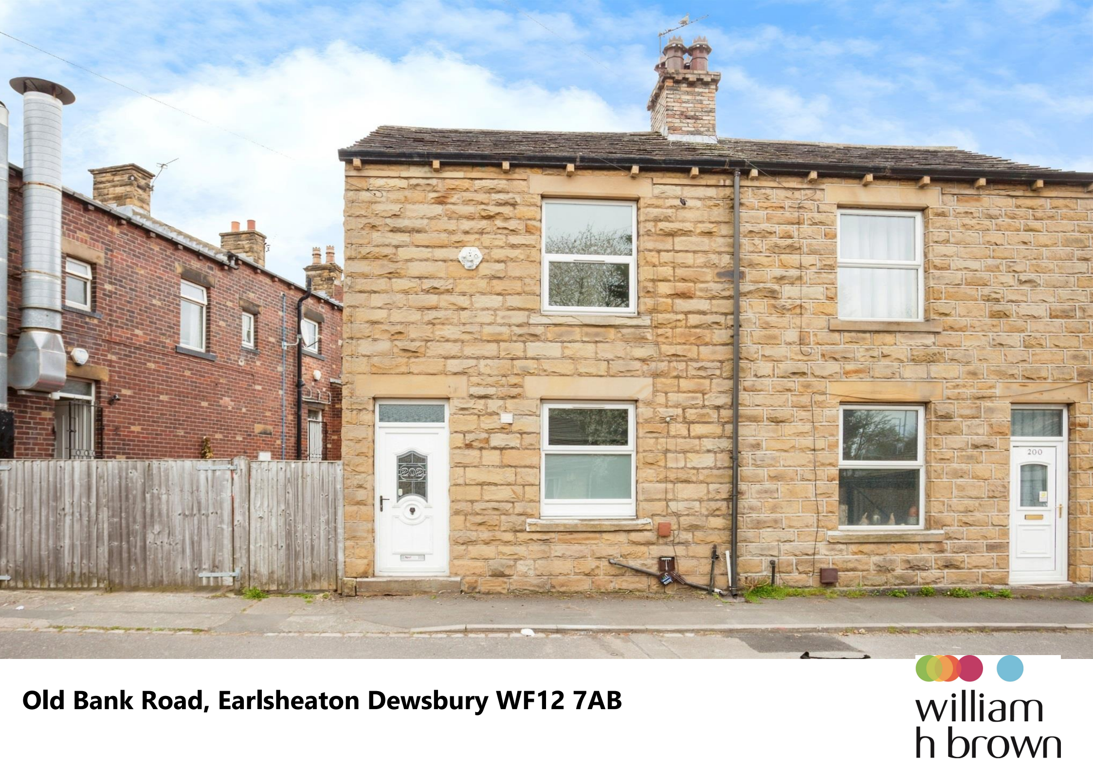
Old Bank Road, Earlsheaton Dewsbury WF12 7AB