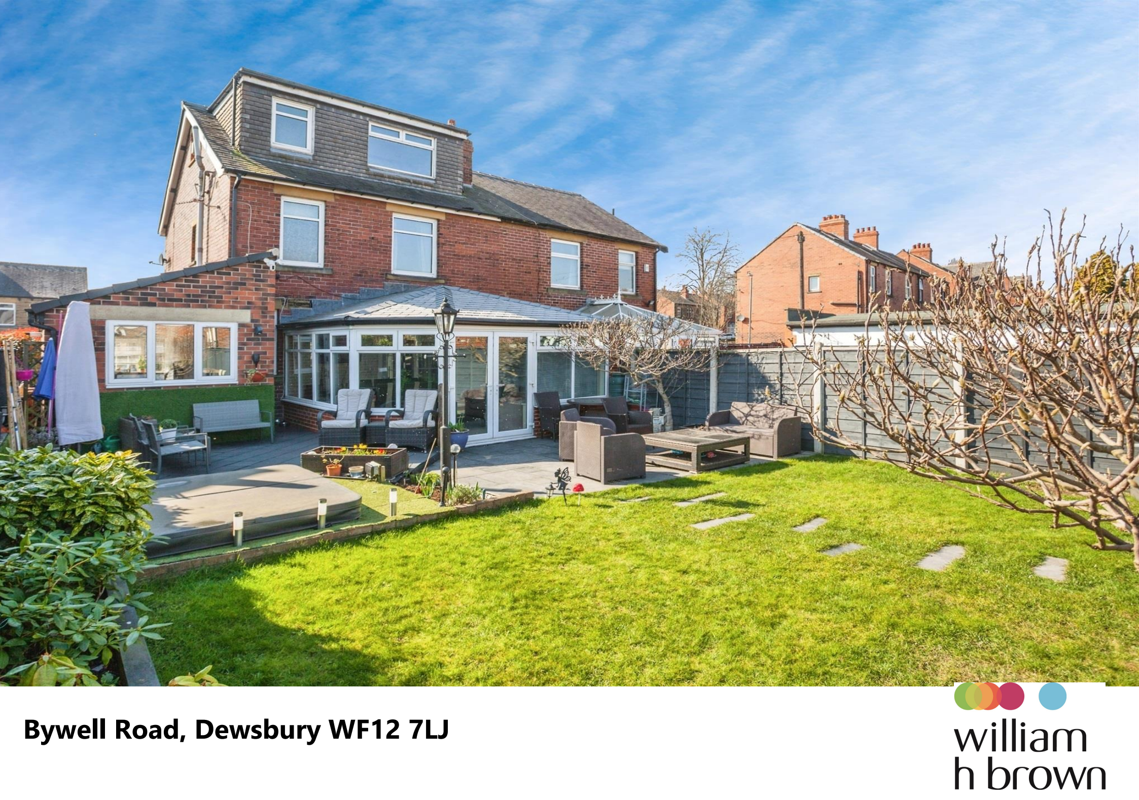
Bywell Road, Dewsbury WF12 7LJ