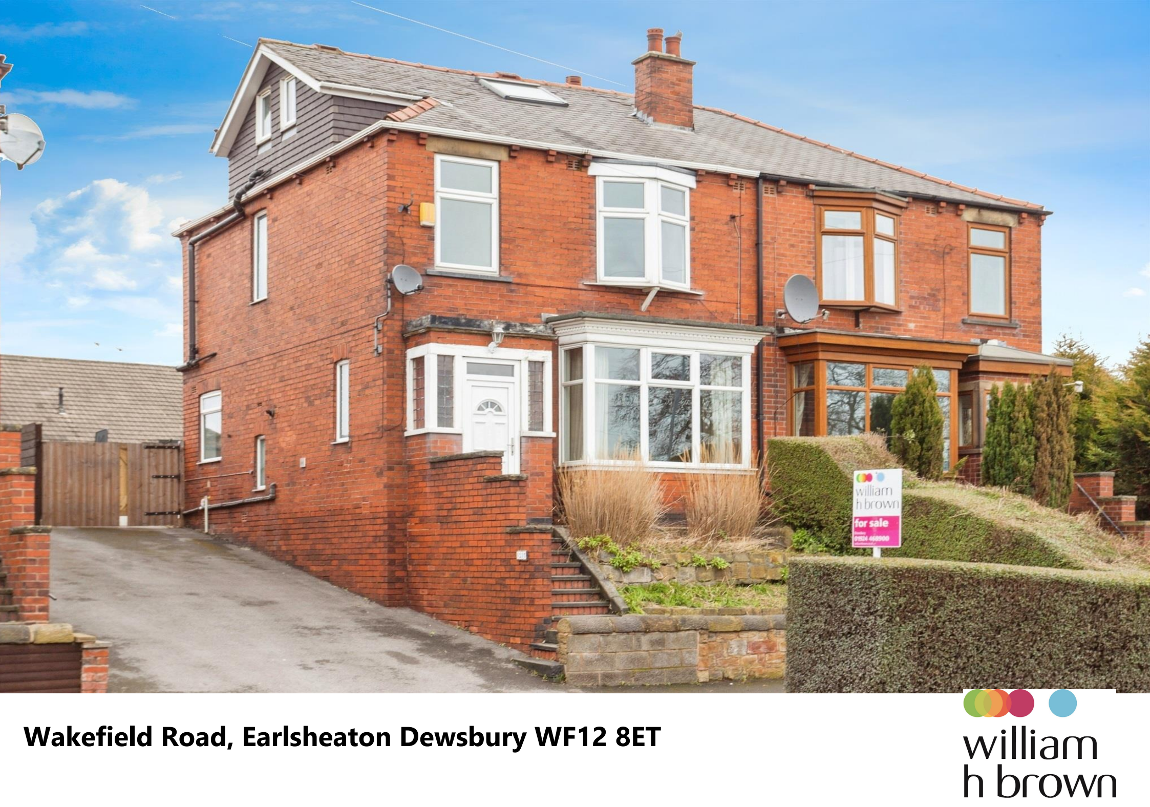
Wakefield Road, Earlsheaton Dewsbury WF12 8ET