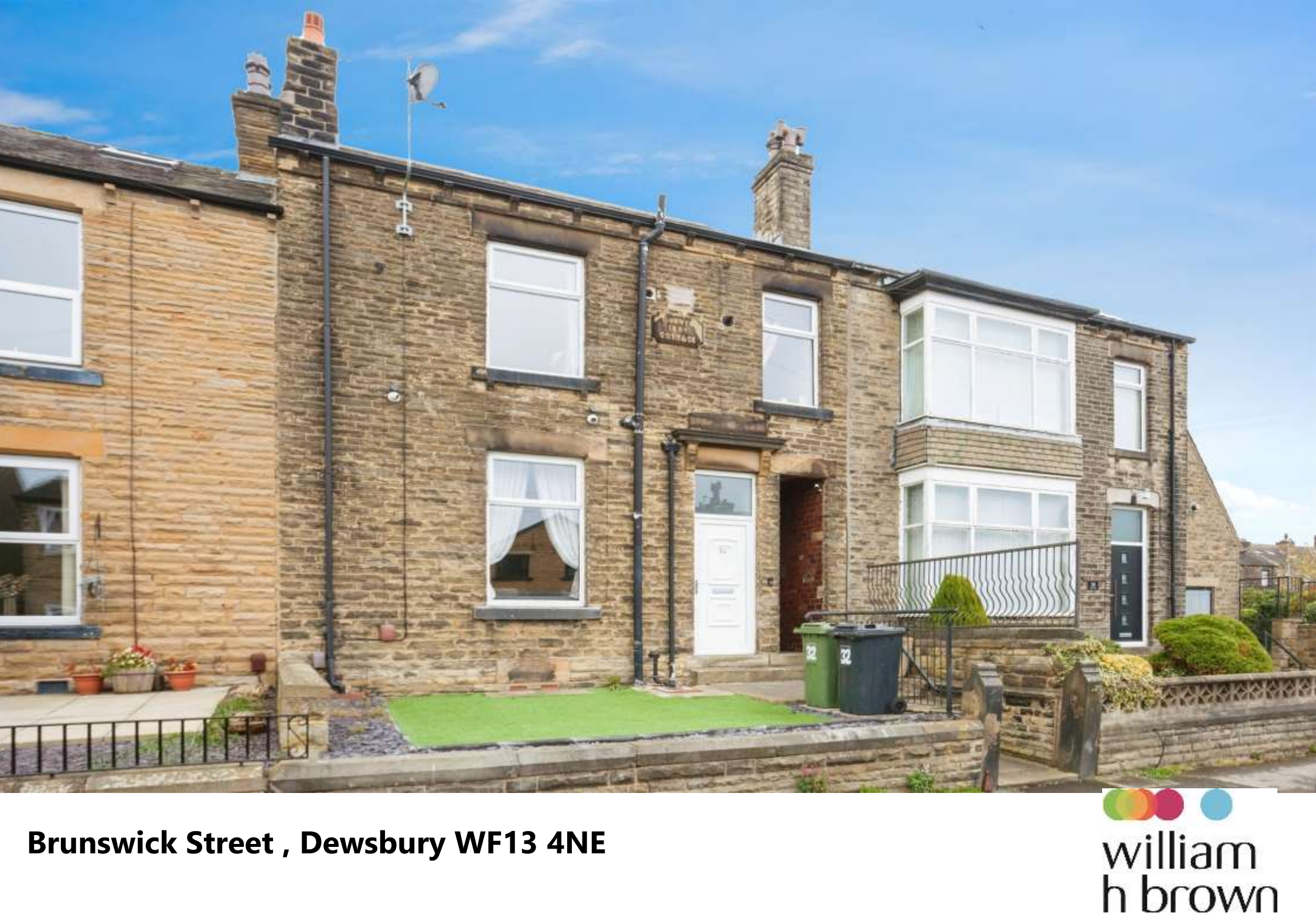
Brunswick Street , Dewsbury WF13 4NE