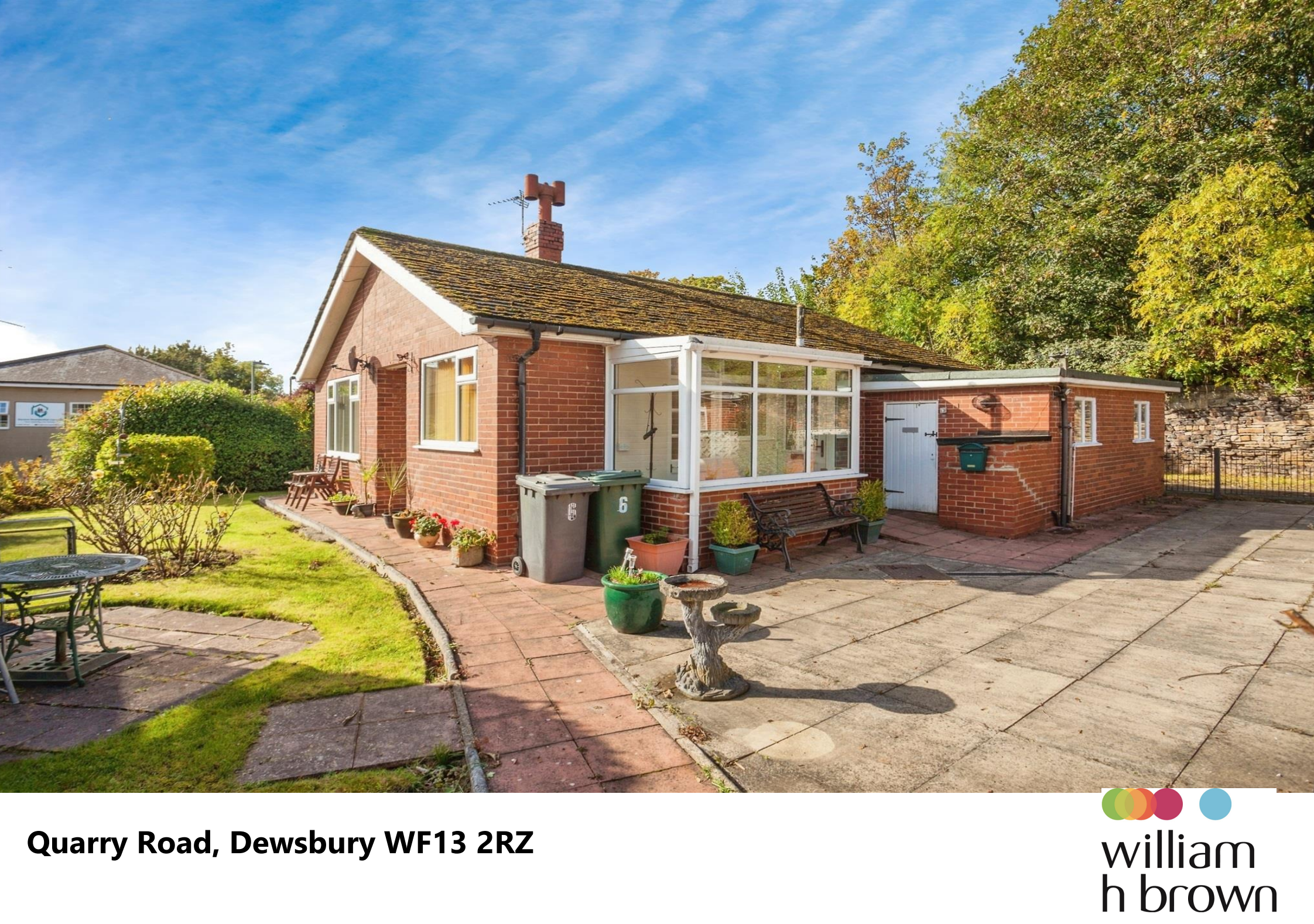
Quarry Road, Dewsbury WF13 2RZ