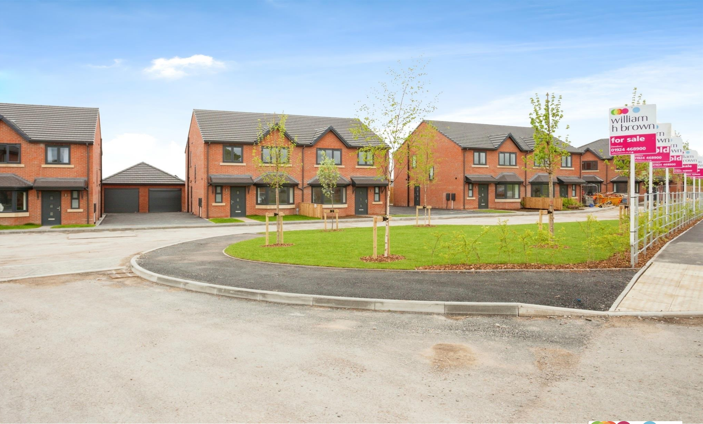
Jubilee Gardens Leeds Road, Mirfield WF14 0JE