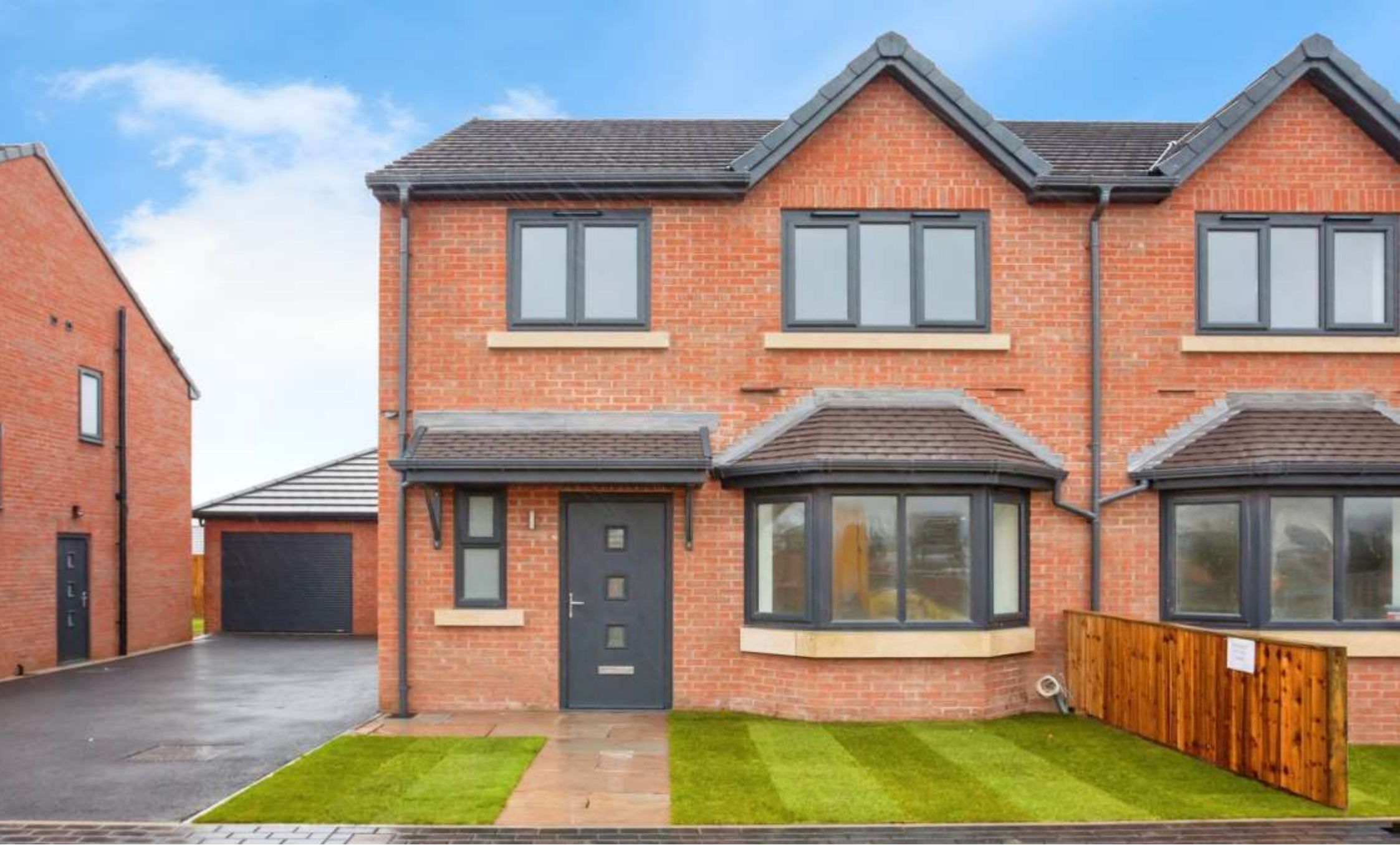
Jubilee Gardens, Leeds Road, Mirfield WF14 0JR