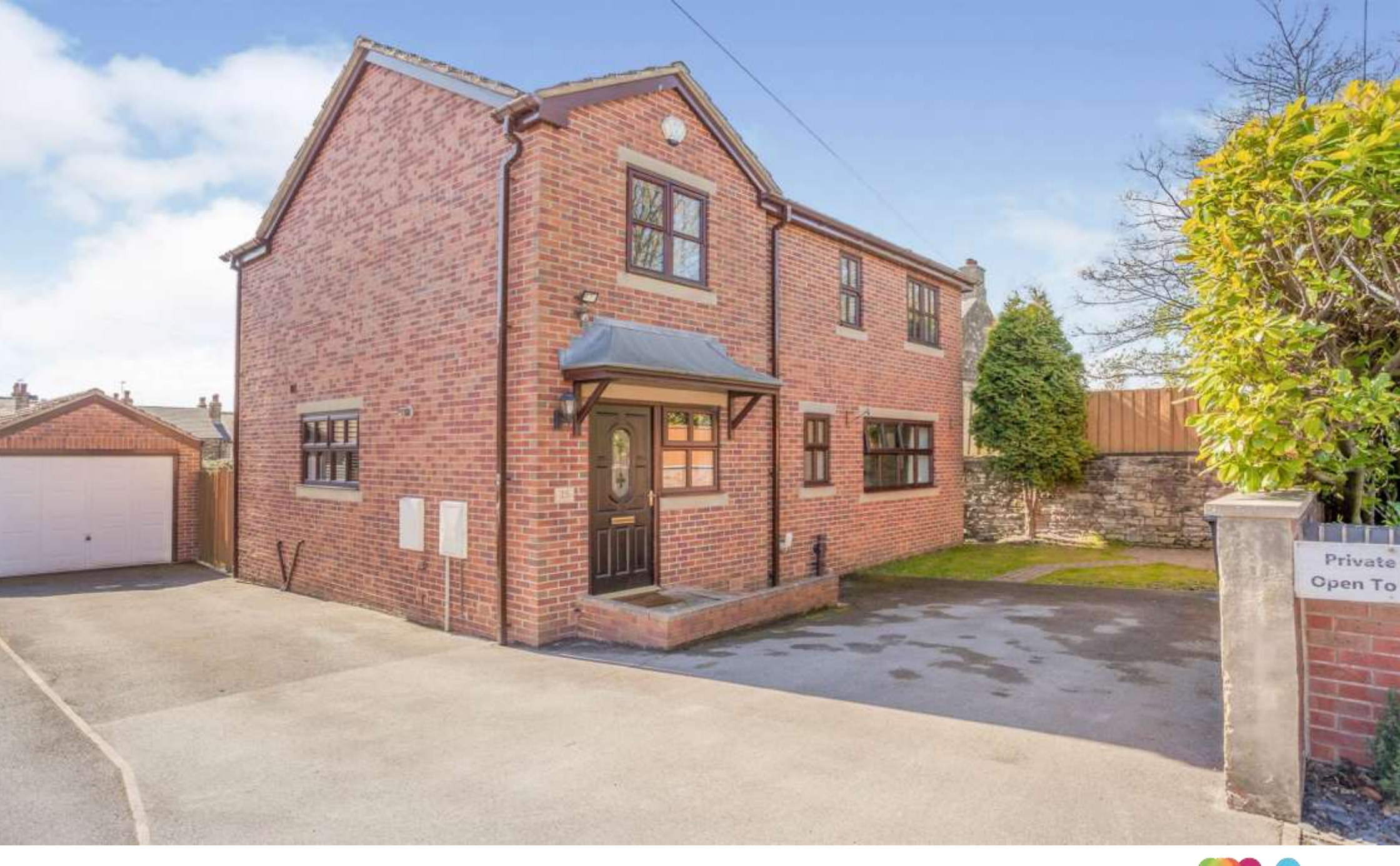
White Cross Road, Hanging Heaton Dewsbury WF12 7DT