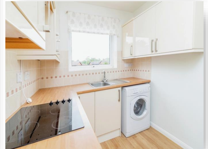
Ruskin Court, Newport Pagnell MK16 0JL