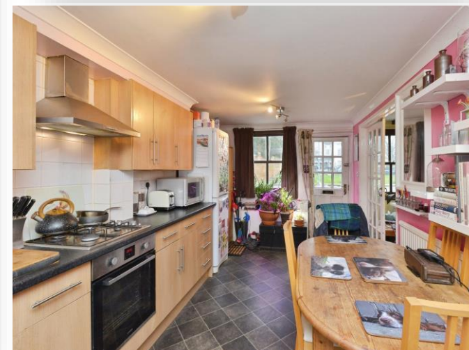
Tickford Street, Newport Pagnell, MK16 9AW