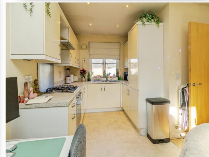
Sheep Way, Redhouse Park, Milton Keynes, MK14 5FP