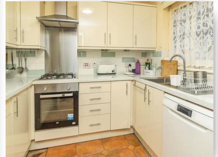
Martin Close, Neath Hill, Milton Keynes, MK14 6JG