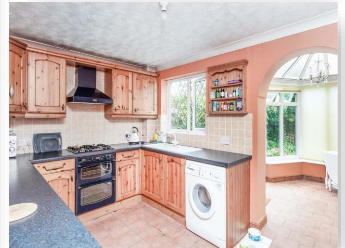
Rivetts Close, Olney, MK46 5PB