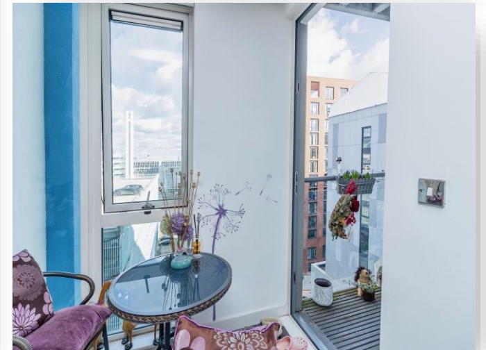
Dakota House Mortimer Square, Milton Keynes MK9 2FB